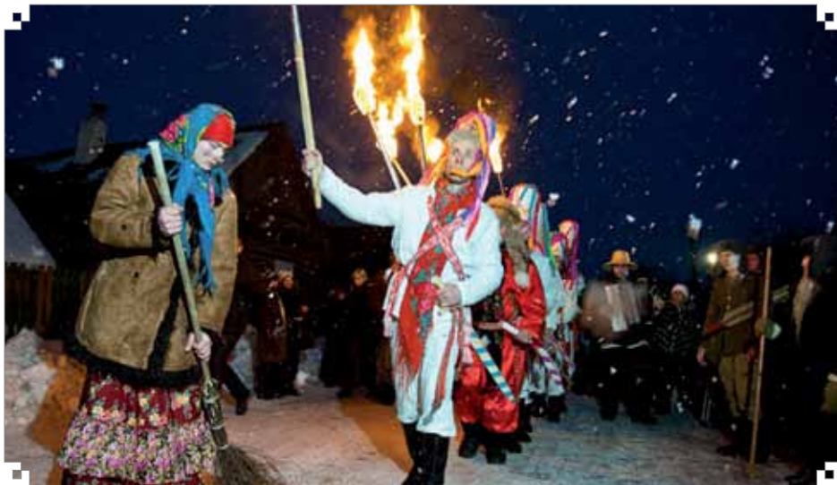
▲ The rite "Kolyadnye kings"