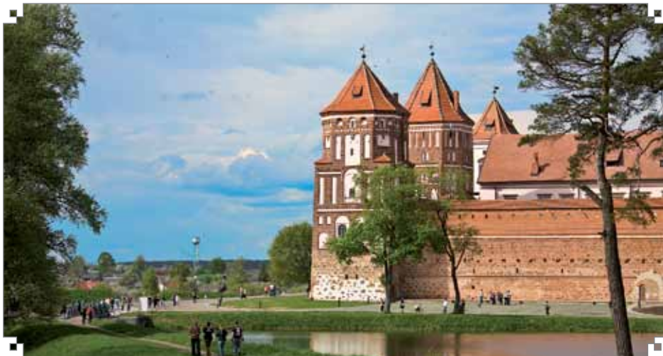
▲ The sight of Mir castle on the part of the lake

Fantastic silhouette of the Mir Castle (Korelichi district, Grodno Region, GPS: 53°27'7"N, 26°28'11"E ) 4 attracts, like a mysterious mirage. At various times, it was owned by the Ilinichy, Radziwilly, Vingshteyny, Sviatopolk-Mirskie families. The construction of the castle was first launched back in the XVI century. Each new owner rebuilt the castle, giving it the features of a Gothic style, the Renaissance, the Baroque style. The Mir Castle is now one of a kind; it has no analogues in Russia or in Poland or the Baltic States. Thus, in 2000 the Mir Castle Complex was inscribed on the UNESCO World Heritage List.