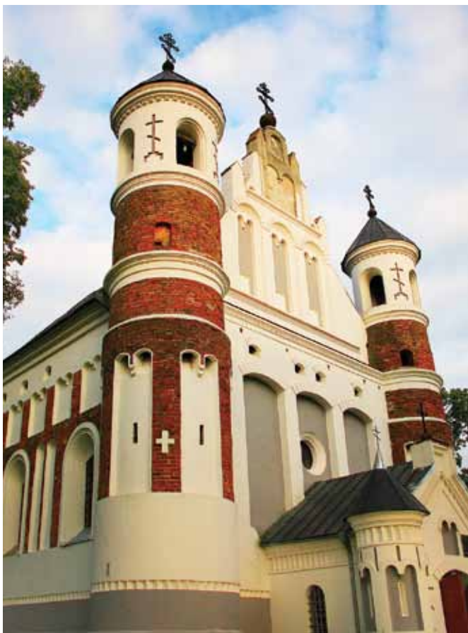
▲ Malomazheykovskaya Church

Wooden cult architecture of XVII-XVIII centuries in Polesie. Features of Gothic, Baroque styles, Classicism and local traditions are harmoniously combined in the guise of Belarusian wooden temples. This is a unique phenomenon that struck the note with the UNESCO experts. We advise you to start with David-Gorodok (Stolin district, Brest Region, GPS: 52°3'21"N, 27°13'48"E ), which preserved the Church of St. George (XVII century) 35 . Draw attention to the beautifully carved iconostasis, which is about 300 years old. In Kozhan-Gorodok (Luninets district, Brest Region, GPS: 52°12'19"N, 27°0'35"E ) Nicholas Church overlooks the landscape (1816) 36 , it is decorated with unique wooden sculptures and carvings. Michael Church (1796) 37 in Rubel (Stolin district, Brest Region, GPS: 51°58'18"N, 27°3'38"E ), is also worth visiting, the Church of Elijah (1881) 38 in Velemichi (Stolin district, Brest Region, GPS: 52°1'12"N, 27°14'32"E ), Michael Church (1784) 39 in Olpeni (Stolin district, Brest Region, GPS: 52°1'19"N, 27°9'35"E ), the Church of Saint Parascheva of the Balkans (1884) 40 in Berezhnoe (Stolin district, Brest Region, GPS: 51°59'35"N, 26°59'31"E ).