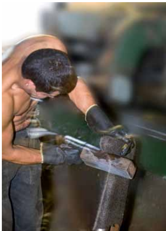
▲ Shapoval's Work

"Shapovalstvo" – is the skills of masterful hand-made creation of felt boots "valenki". The first mentioning about this art in Dribin district dates back to the XIX century. Local peasants were engaged in 'shapovalstvo' in order to get by, because their land was far from being fertile. Masters went to the villages, selling their simple products. There is evidence that they even traveled to America! In order not to give away the secrets of their profession, Shapovaly-masters used a special secret language. Some elderly residents of the Dribin district are familiar with the language to the present day. Living traditions of the masters-Shapovaly are carefully preserved in the studio under the historical and ethnographic museum of Dribin, where people teach ancient craft to their children.