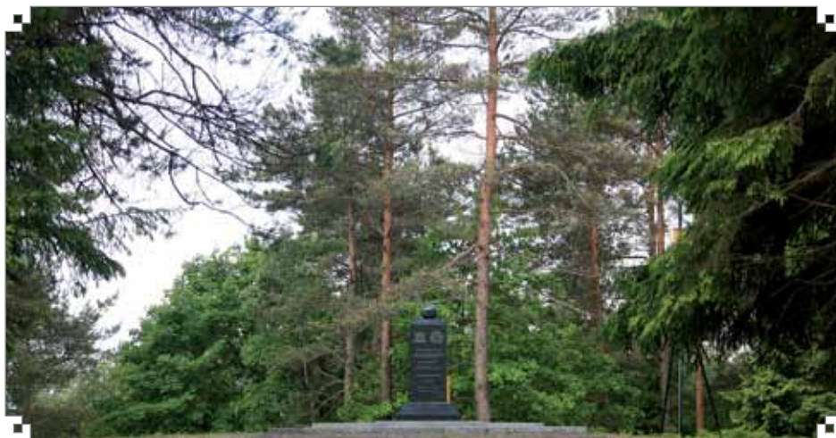
▲ Geodesic point Tyupishki. Oshmyany district

S truve Geodetic Arc, which is also known as the Russo-Scandinavian meridian arc, can be easily inscribed on the Guinness World Records as the first accurate measurement of a meridian and the longest monument in the world. It is a chain of survey triangulations stretching from Hammerfest in Norway to the Black Sea, through ten countries and over 2,820 km.