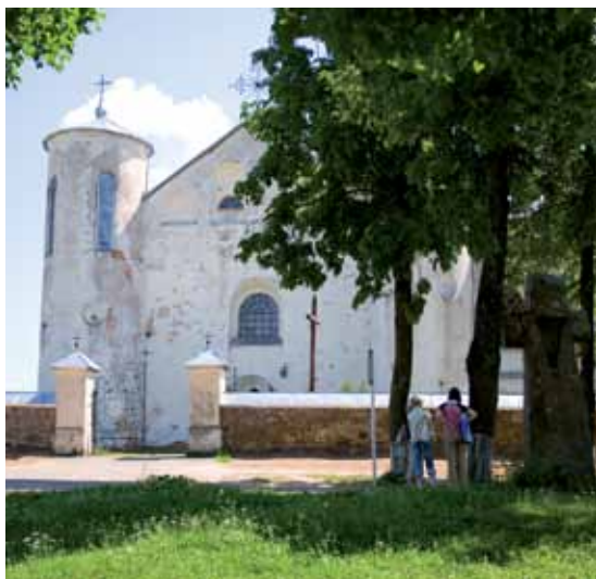
▼ Church of St. John the Baptist

In the dashing days the temples were often used not exclusively for the sermon processions, but for defensive purposes as well. Belarus has preserved three unique temple-fortresses. Malomazheykovskaya Church or Murovanka (XVI century) 27 (Schuchin district, Grodno Region, GPS: 53°41'59"N, 25°0'7"E ) which combines the features of the Gothic style and Renaissance. Warlike appearance of the temple struck the note with Charles XII during the Northern War, and he ordered to bombard the church immediately. The Church of St. John the Baptist (the beginning of XVII century) 28 in the Kamai (Postavy District, Vitebsk Region, GPS: 55°3'37"N, 26°36'19"E ) has never closed during its entire