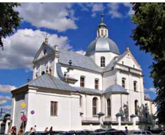
▼ The church of Christ's body

Paintings by the great masters, hetman clubs, and marshal's batons, family silver and gold - all this was the decoration at the Nesvizh residence. But the hosts were particularly proud of the 12 Apostles, gold and silver cast in full life-size. During the 1812 war the precious sculptures disappeared. According to one version, they are hidden somewhere in the vicinity of the castle. And a mysterious treasure has been haunted by the adventurers for more than two centuries now. It is believed that the most famous ghost of Belarus Chorna Lady (The Black Lady), miserable soul of Barbara Radziwiłł, who was poisoned by vengeful queen Bona Sforza, inhabits one of the towers of the Castle. Another legend is associated with the Niaswizh famous 35-kilometer underground passage leading to the Mir Castle. And though archaeologists did not manage to find such a lengthy tunnel, underground