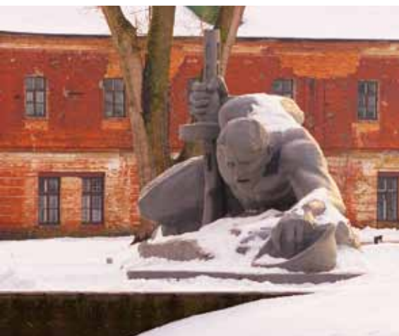
▼ Memorial complex "Brest Hero Fortress" "Thirst" sculptural group

The Kalozha Church of St. Boris and Gleb (1189 г.) 24 in Grodno (Grodno Region, GPS: 53°40'42"N, 23°49'6"E ) – is the only surviving monument of the medieval Grodno architectural school that has been preserved till the times we live in. The temple emerged on a steep bank of the Neman River, on a former site of a pagan sanctuary. Wonderful ornaments, lined with stones and shaped tiles are the main peculiarities of the church. Another feature is the clay resonators (the vessels built into the wall with their necks looking outside) that give the building terrific acoustics. Kalozha Church is popular with newly wedded couples: a marriage contracted here is believed to be happy.