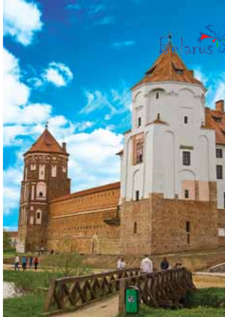
▲ The sight of Mir castle on the part of the island

Farmstead "Svityazyanka", Grodno Region, Korelichi