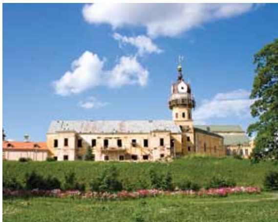
▲ Niaswizh castle

Medieval music and tilting matches, mock battles – you can witness it all with your own eyes at Niaswizh medieval festivals that take place in spring and summer. Fans of classical music are rushing to "Muses of Niaswizh" Niaswizh May Festival of Chamber Music. The roar of powerful motorcycles invades the city streets in