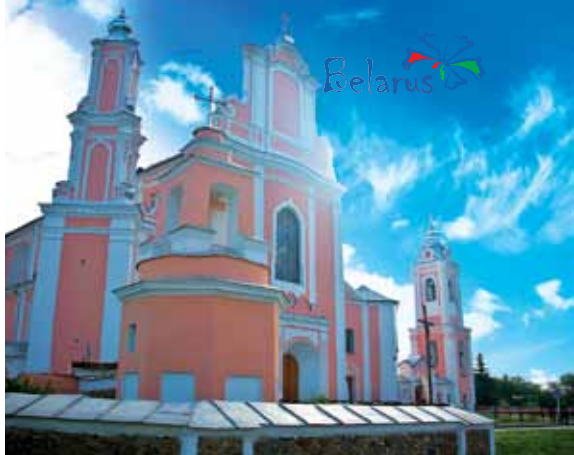
▲ Peter and Paul Catholic Church in Baruny

ruins of a medieval castle of the Sapiehi is preserved (early XVII century) 17 . Franciscan Monastery and THE Church of St. John the Baptist are also worth visiting (XVII century) 18 . The legend has it that the castle and the monastery were inhabited by ghosts. From Golshany it is easy to get to Boruny (Oshmyany district, Grodno Region, GPS: 54°19'4"N, 26°8'11"E ), where a spectacular St. Peter and Paul Church makes an ever-lasting impression on travelers (XVIII century) 19 . The temple became famous due to a 300-year-old wonder-working icon of Borunsk Mother of God.