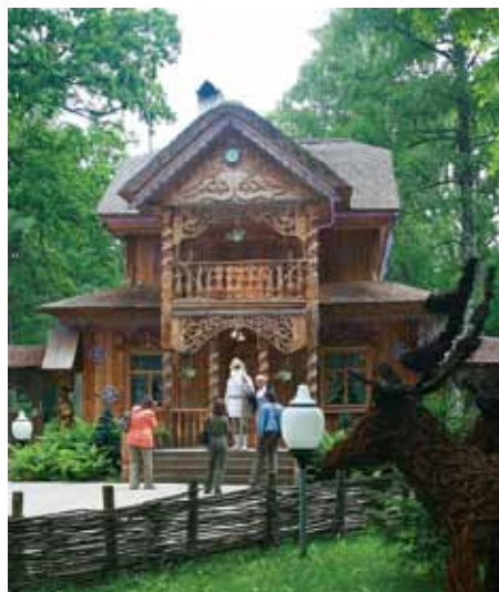
▲ The estate of the belarussian Father Frost