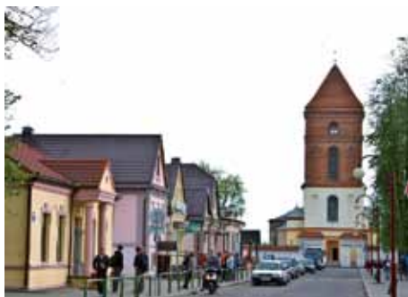
▼ St. Nikolai church and the square building

The restoration of the Mir Castle has recently been completed. The exhibition that is housed in the towers and