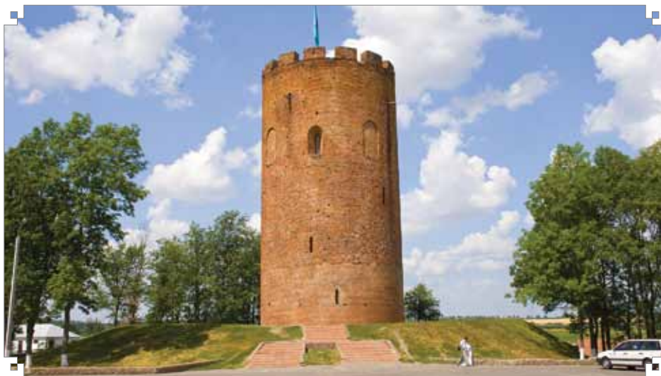
▲ The Tower of Kamianiec

World famous architects and most talented engineers have created their masterpieces in Belarus during centuries. Besides four iconic landmarks that have already made the part of the human treasury, ten more remarkable highlights have been recently inscribed on the UNESCO Preliminary List. And, perhaps, in the short term they will enlarge the Master List of the UNESCO World Heritage.