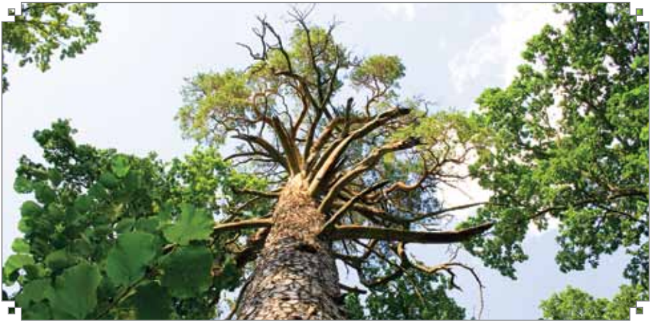
▲ The giant pinetree

W ild and pristine Białowieża Forest (Kamenyuki village, Kamenets District, Brest Region, GPS: 52°33'18"N, 23°48'14"E) 1 is located in the southwest of Belarus, on the border with Poland. The national reserve covers a huge area of over 160 thousand hectares and is one of the largest in Europe.