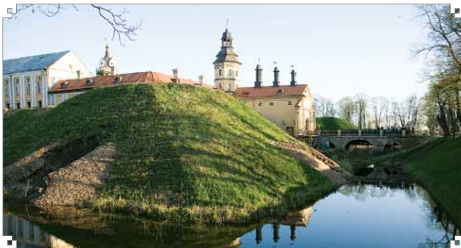
▲ Niaswizh castle during the restoration time

N iaswizh Castle (Niaswizh district, Minsk Region, GPS: 53°13'22"N, 26°41'30"E) 7 – a living legend of the Belarusian land. A magnificent residence was built by powerful Radziwiłł in the XVI century. The Radziwiłł family got a nickname uncrowned kings of Rzeczpospolita since the Radziwiłł were one of the most important and wealthy clans of the Grand Duchy of Lithuania. The wealth and influence of the members of this genus was so great that even the French monarchs had