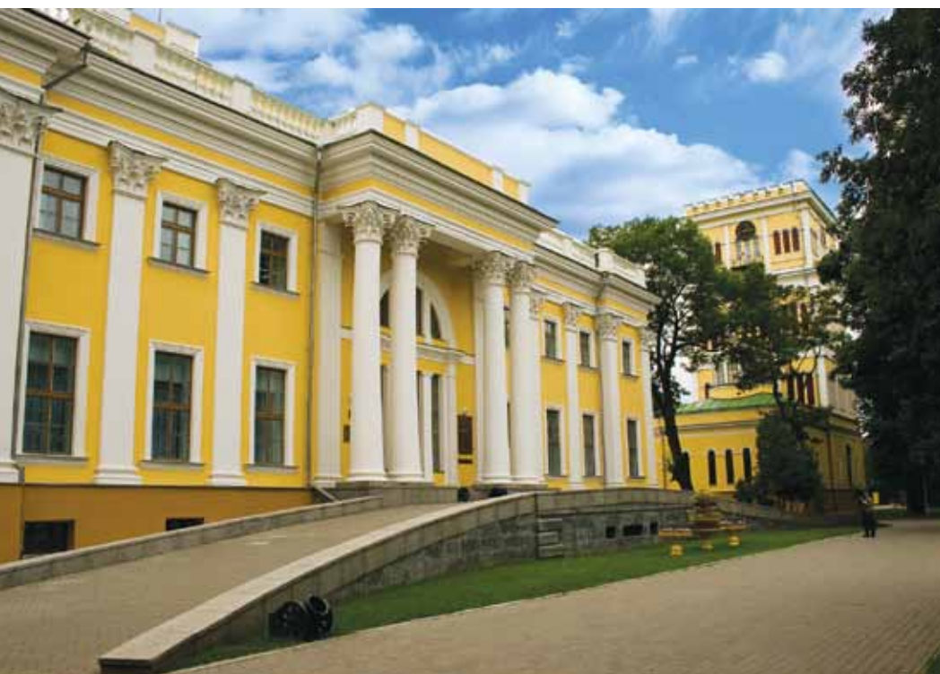
▼ Gomel Palace & Park Ensemble

Architectural Ensemble of Independence Avenue (1940–1950) 33 in Minsk (Minsk district, Minsk Region, GPS: 53°54'8"N, 27°33'42"E ) – is a trademark of the Belarusian capital. This is the largest street in the world, built up in a single architectural style – in Stalin's Empire Style. The Avenue is notable for the fact that throughout its history it has changed 14 titles. The very first name of the Avenue was the street Zakharyevskaya – it was given in honor of the first governor of Minsk. During the Second World War the city was badly damaged it had to be rebuilt almost from scratch. The main city avenue was designed on the basis of the Nevsky Avenue that is in St. Petersburg: the width of the carriageway is exactly 2 times the height of the buildings. This creates an impression of spaciousness and festivity. Meanwhile the mighty buildings, decorated with so many little details, following the idea of the then