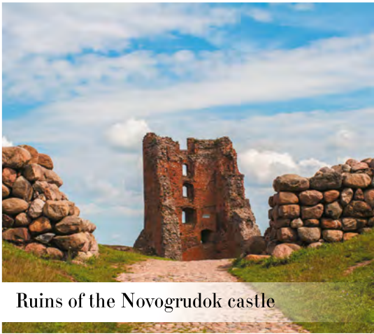
Ruins of the Novogrudok castle

What can stir the blood of a lover of mysticism and mysteries than medieval castles? Over a hundred castles surrounded by legends, secrets and riddles are found in Belarus.