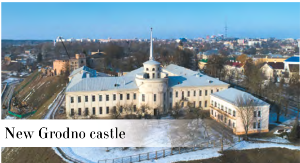
New Grodno castle